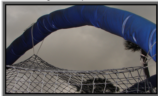
netting is attached to the cage inside, not laced like the front bow.